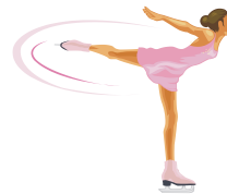
Skate Night – April 10th