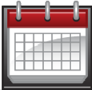
World' Finest School Calendars

Need to buy your school calendar, 4th / 5th grade planner or stock up on Burning Tree spirit items? Visit the Spirit Shop during the Volunteer Fair on Tuesday, September 2nd, from 7-7:30pm in the BTES cafeteria! Bring CASH or a CHECK to buy